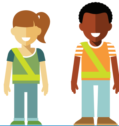
At Ease Position